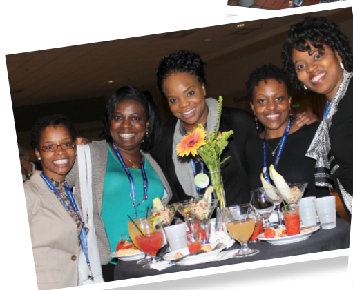
Women in Pharmacy Mix, Mingle and Margaritas