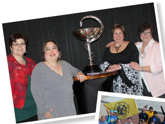
Bowl of Hygeia Reception

In March 2016, our supporters from all over the country traveled to Baltimore, Maryland for the 2016 APhA Annual Meeting and Exposition. The APhA Annual Meeting provided an excellent opportunity for the Foundation to connect with supporters and donors from all across the country.