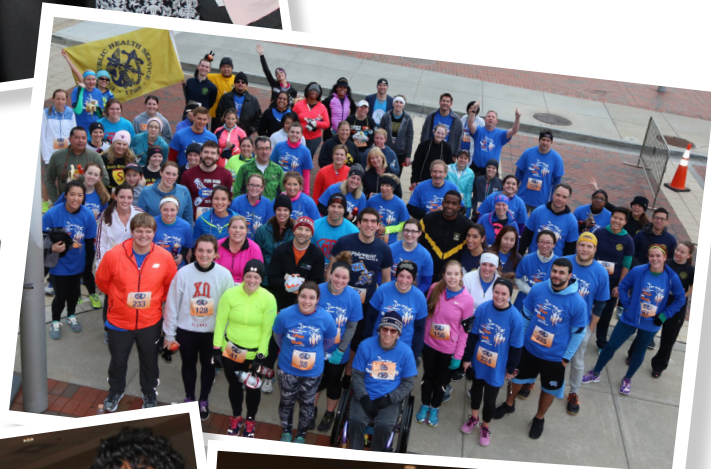
5K Fun Run/Walk