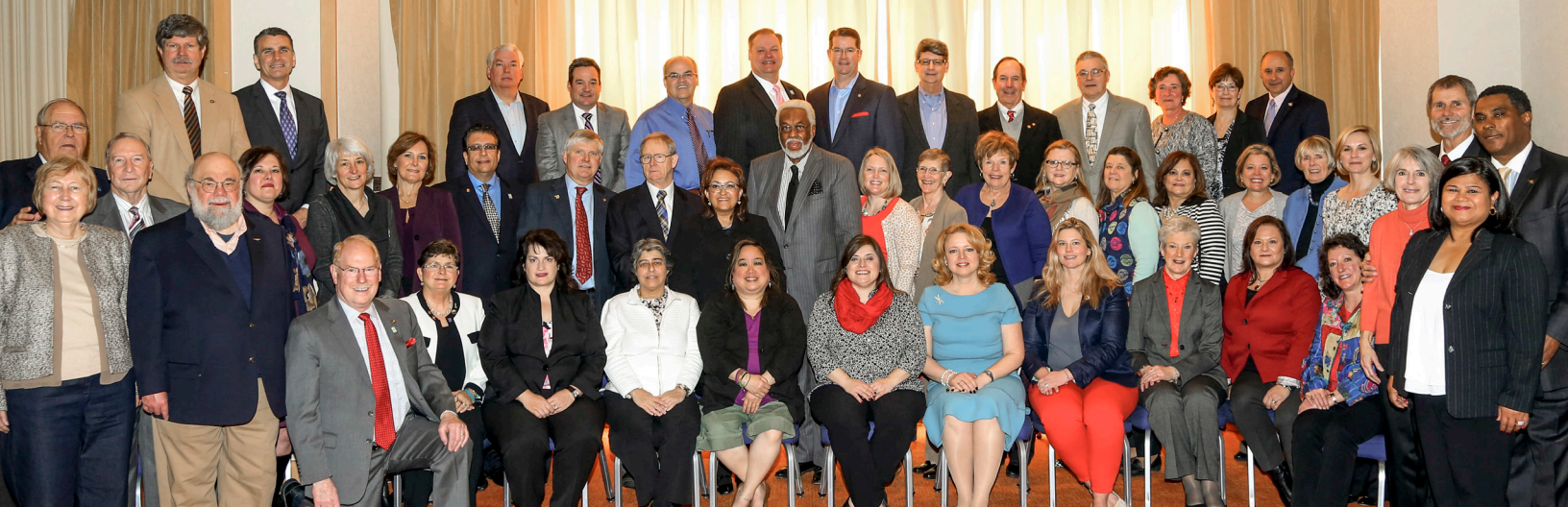
Photo from the 2016 APhA Annual Meeting in Baltimore, Maryland.