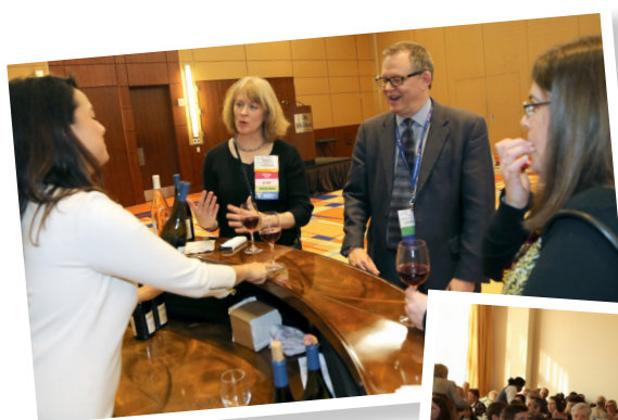
Wine Tasting and Silent Auction